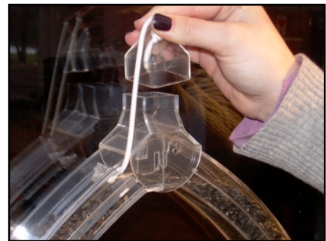
The cap and chimney turns upside down for easy filling.

Your feeder comes with a 30 day return policy and warranty. Please visit us on the web for details. wildbirdlover.com