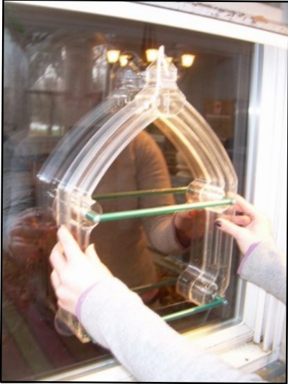
Mount on CLEAN window