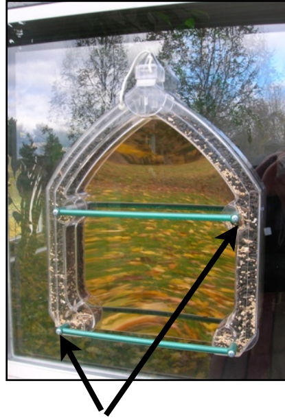
Push to secure all four cups.

Your feeder arrives fully assembled. Clean the outside of your chosen window carefully. Mount the feeder in above freezing weather, and make sure the suction cups are pliable before attaching. When in place, push firmly on the end of each landing perch to make sure each suction cup is fully secured. (Confirm from the view inside the window.) Periodically remove and clean the feeder with warm water and mild soap before reattaching to a freshly cleaned window.